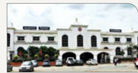
Vijayawada Railway Station