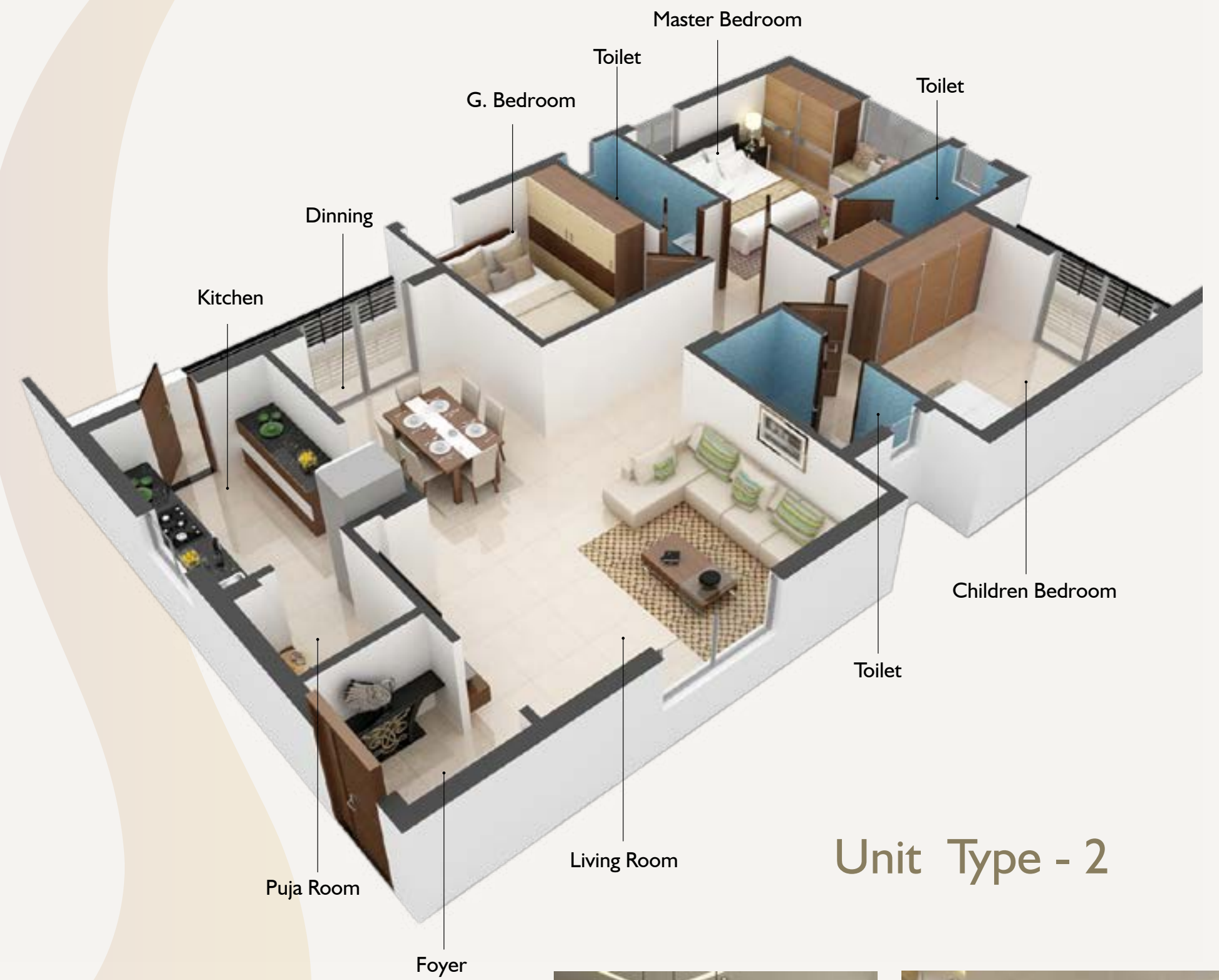
Unit Type - 2