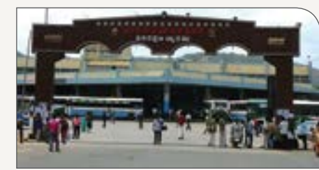
Vijayawada Bus Station

Note: This brochure is purely a conceptual presentation and not a legal offering. The promoters reserve the right to make changes in elevation, specifications and pans as deemed fit.